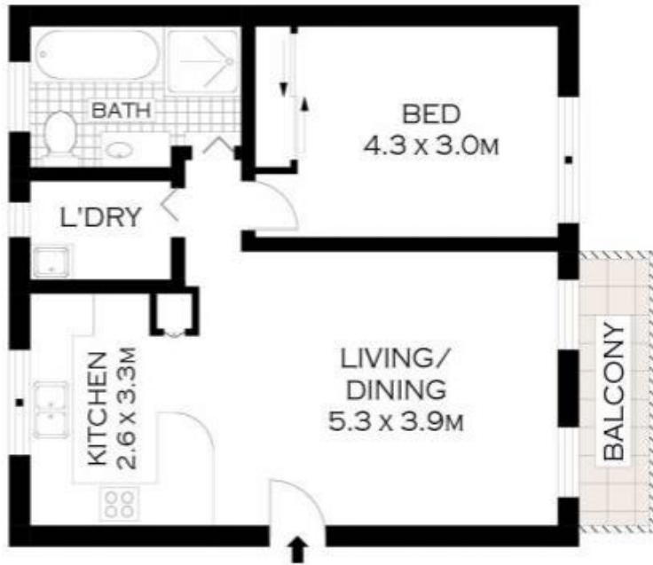
ELEVATED GROUND FLOOR