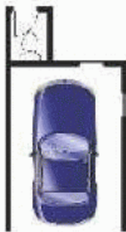
Garage 2.8 x 4.0 m