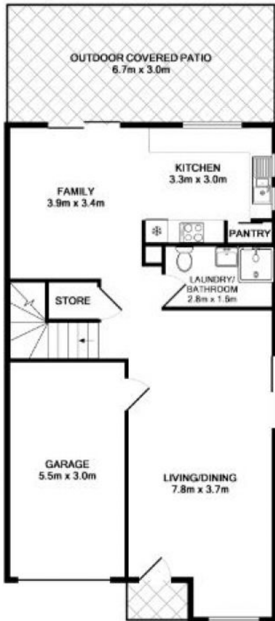
GROUND FLOOR APPROX. FLOOR AREA 78.7 SQ.M. (847 SQ.FT.)