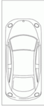
Carspace 5.3 x 2.2m