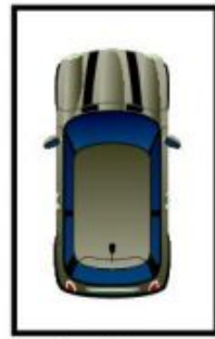
Car Space 2.8 x 4.1