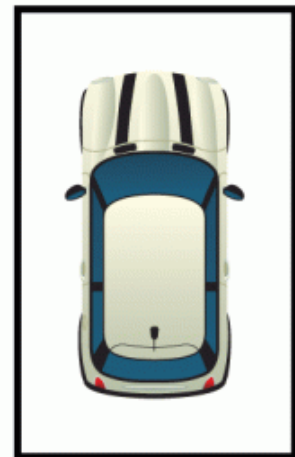
Lock Up Garage 5.0 x 3.0